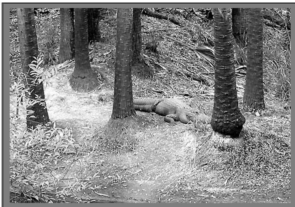
Little Big Econ, April 13, 2002