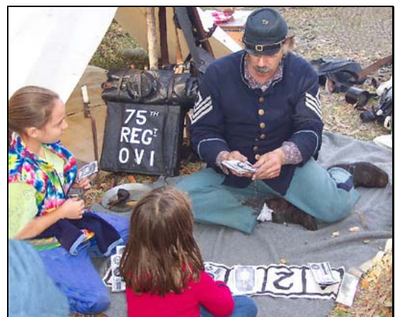
A money management lesson